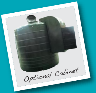
**Add 680mm to the length if an optional cabinet is required for low level filling

With a wide range of sizes available they are suitable for domestic, industrial and institutional use.