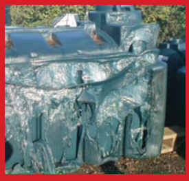
Unprotected tanks can be damaged by fire

The Envirostore Firecheck Tank. With a combination of the strength and security of steel, combined with the practicality of a plastic inner tank, and the protection of a fire rated material, all giving peace of mind to the installer.