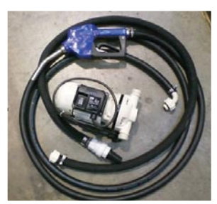
Enviroblu gun, pump and hose