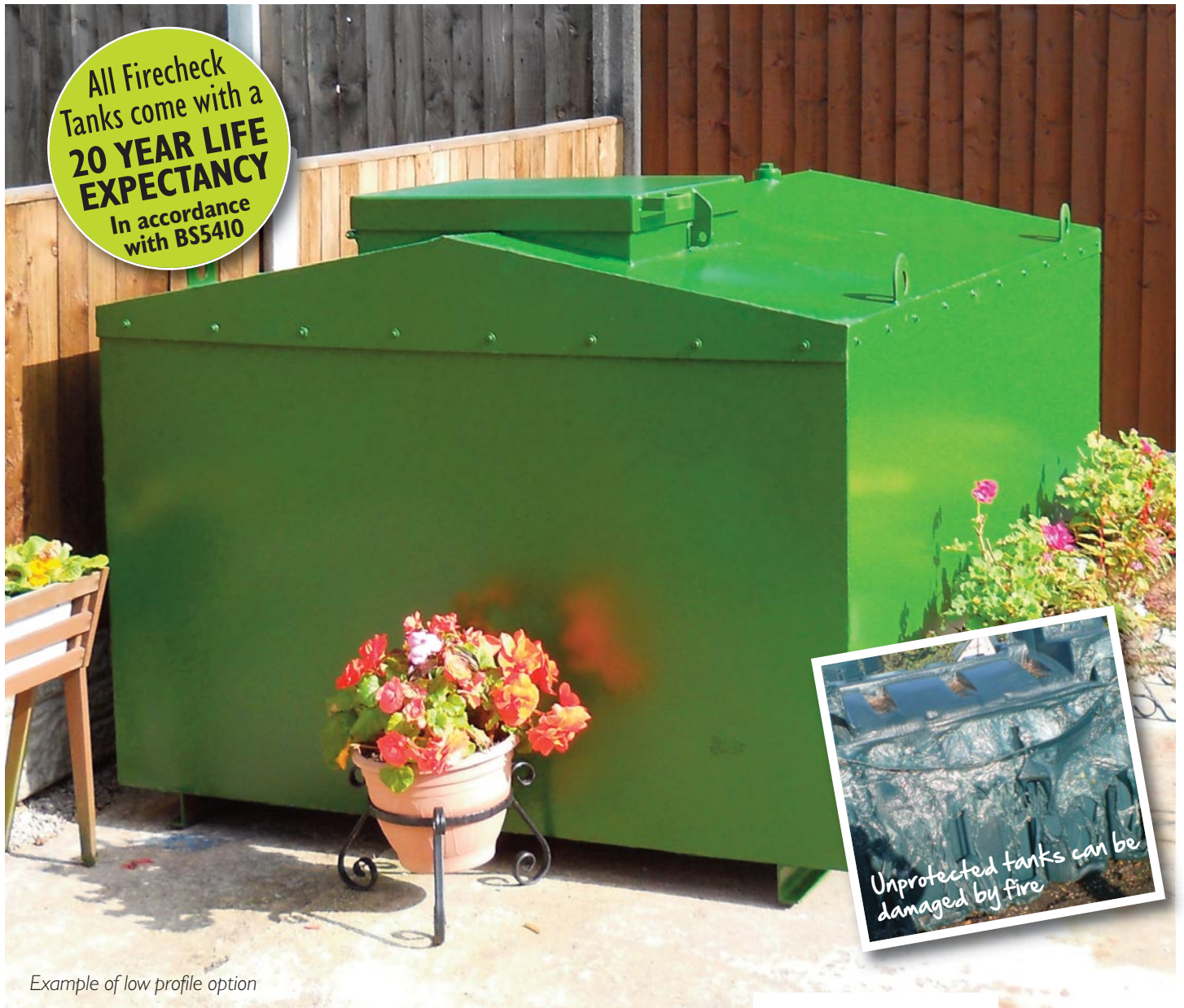
Example of low profile option

The inner area of the tank is clad in a 30 minute fire rated material, then completely enclosed in a mild steel outer tank, making the unit weatherproof and secure.