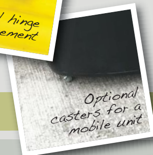
Optional casters for a mobile unit